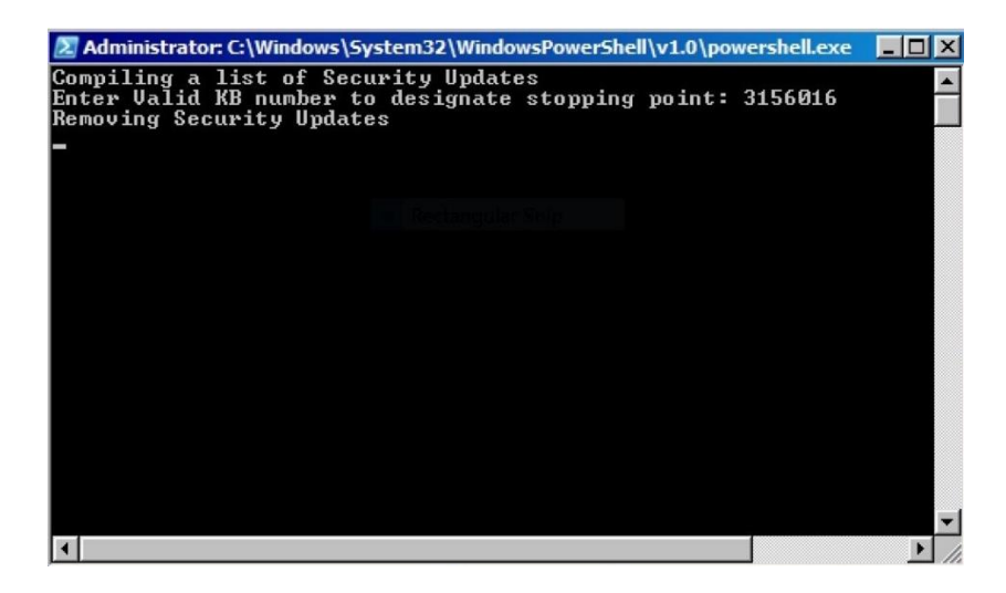
Figure 5: The script in action.

The current prototype can uninstall all security updates except for a few that are protected, presumably by Microsoft, after running the script three times with restarting the system after each run. The script will successfully stop removing patches at the given KB number. This means that an instructor (or similar expert) would be able to provide the KB number of the update which patched the desired vulnerability, often found on the security bulletins on the Microsoft developer website. The script has been tested on Windows 7 and Windows 8.1 virtual machines with success, and initial research into the Windows 10 operating system looks promising. It handles updates in the same way as its tested predecessors, and the script runs successfully. However, there are few confirmed vulnerabilities that a full exploit could test at this time since Windows 10 is a reasonably new operating system.